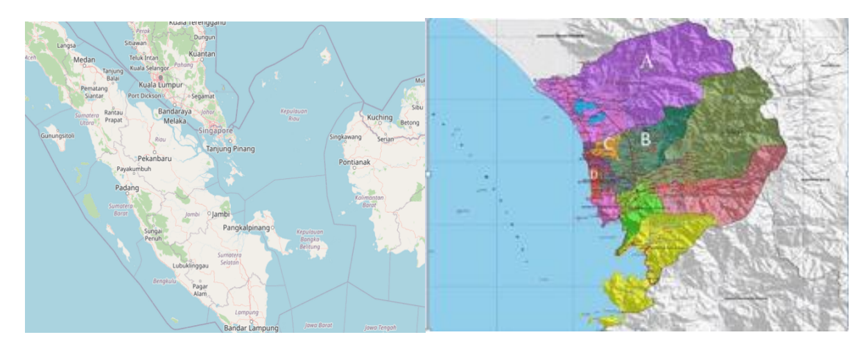
Fig. 1: Padang City, West Sumatra (https://peta.web.id/map/city/padang-city)

Arachis hypogaea L.). To collect the legume plants, a shovel was used to dig up the plants completely, including the roots and rhizosphere soil, which were then transported to the laboratory. Five plants were sampled at each location (Fig. 1) and placed in tightly closed plastic bags with open tops. The soil and plant samples' moisture were maintained at field capacity during transportation to the laboratory.