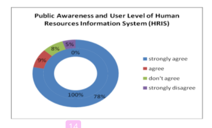
Figure 1. Public Awareness and Usage Rate Human Resources Information System (HRIS) in West Sumatra

Information technology is an infrastructure investment in organizations [14] (Lefley, 2013). This implies that investment in information technology related to HR is part of the organization's infrastructure investment