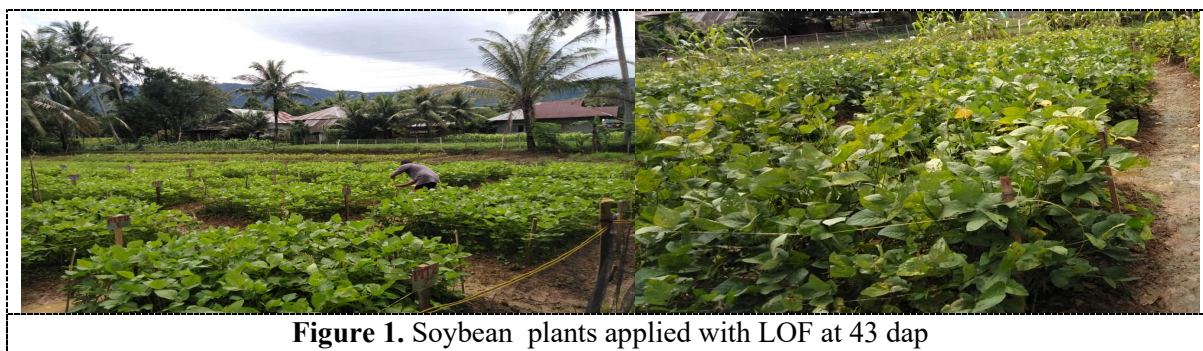
Figure 1. Soybean plants applied with LOF at 43 dap

There were also indications that liming which raises soil pH increases the general growth of soybean plants. Trichoderma sp added to any type of LOF can increase the pH of the soybean plant rhizosphere. From table 4, it was also proven that the addition of tithonia to the raw material of C.odorata LOF can reduce the pH of the soybean rhizosphere. The highest plants were those given LOF Crocoberma and Titocrocoderma. The same pattern also occurred in the formation of the number of plant branches. The plant's fresh weight was higher than the Titocrocoderma LOF treatment. There had been a higher of 16.44% plant height, 23.25% number of branches, and 50.15% weight of stover in plants given LOF than to those not given LOF.