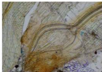
Fig. 3 Cross-section of hairy roots transformed with A. rhizogenes with blue color (designated by arrows).

GUS test was performed to determine the integration of Ri T-DNA plasmid R1000 strain of A. rhizogenes bacteria into the genome of C. asiatica plants. In the hairy roots of C. asiatica which had been soaked in a solution of X-gluc for 24 h showed the formation of blue spots (Figure 3) in the root cells. This proved that the T-DNA of plasmid was integrated into the plant cell. [13] suggested that the gene wGus gene was gene reporter that encoded the synthesis of \beta -glucuronidase, an enzyme that could hydrolyze a colorless substrate 5-bromo-3-indolyl 4-chloro-glucuronide (X-gluc) became blue. [19] stated that the expression of \beta -glucuronidase gene activity (GUS) in transformed plant cells of the T-DNA could be used as an indicator of T-DNA integration into the plant genome. Expression of the cell strains of Agrobacterium infection is shown as blue spots by giving 5-bromo-4-hydroxy-3-indolyl chloro-glucuronic acid (X-gluc). [20] explained that the expression of transgenic cells would be clear when analyzed using GUS parameters and could also describe the expression and function of the tissues of the transgene.