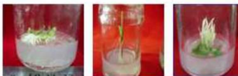
Figure 2. Response of some explants of C. asiatica inoculated with R1000 strain ( A. Stolon, B. apical buds, leaf explants of C. asiatica )

The highest number of hairy roots formed was on R1000 strain of A. rhizogenes treatment with leaf explants was 27 hairy roots and followed by stolon and shoot apical (Figure 2). Based on the average number of hairy roots, hairy root emergence, percentage of living explants and the average of initiation time, it could be stated that inoculation using R1000 strains showed the best results and the best source was leaf explants.