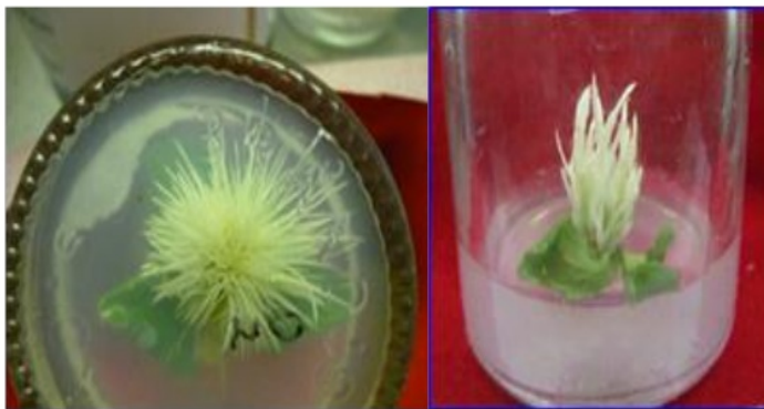
Figure 2. Culture of hairy roots of C. asiatica after addition of Squalene

Data on content of secondary metabolite statistically show the significant differences among treatments. Addition 300 ppm Squalene could increase triterpenoid content higher than the treatment of 150 ppm, 450 ppm and control. Squalene is a mediator compound that is formed near triterpenoid so it can increase triterpenoid content. Squalene is known as precursor of oksido Squalene is also called epoxy-squalene, which is an intermediate compound to form triterpenoid. According to [6], the addition of Squalene can increase activity an enzyme like HMGR.