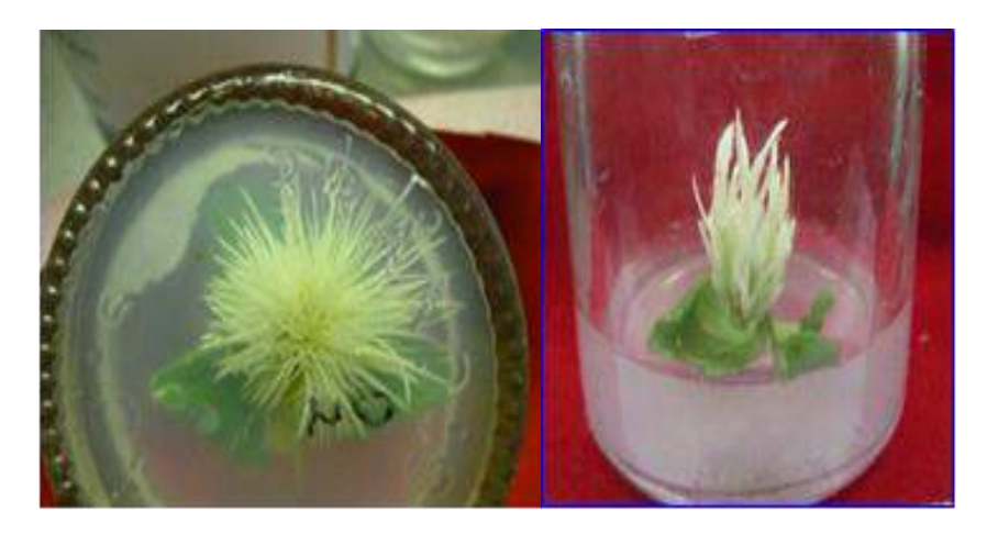
Figure 2. Culture of hairy roots of C. asiatica after addition of Squalene

Data on content of secondary metabolite statistically show the significant differences among treatments. Addition 300 ppm Squalene could increase triterpenoid content higher than the treatment of 150 ppm, 450 ppm and control. Squalene is a mediator compound that is formed near triterpenoid so it can increase triterpenoid content. Squalene is known as precursor of oksido Squalene is also called epoxy-squalene, which is an intermediate compound to form triterpenoid. According to [6], the addition of Squalene can increase activity an enzyme like HMGR.